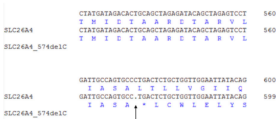
Figure 3. SLC26A4 amino acid sequence alignment between normal and c.574delC (Part), Asterisk: termination codon.

(c.2168A>G) in Korean (17). The deaf population in South America and North America is dominated by p.V609G (c.1826T>G) mutation and IVS8+1G>A (c.1001+1G>A) mutation, respectively (18). Along with increasing research related to genes, more and more novel mutations have been reported in Chinese patients. c.919-2A>G (IVS7-2A>G) and p.H723R (c.2168A>G) account for the majority of mutations in China (19).