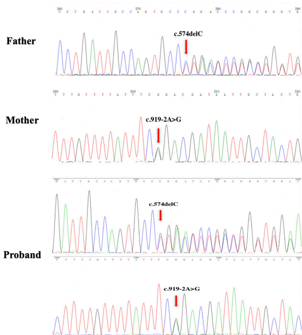
Figure 2. Sequence electropherograms of abnormal sequences from three members of this family.

heterozygous carrier of the c.919-2A>G mutation, and the father was a heterozygous carrier of the c.574delC (p.Leu192Ter) mutation. Figure 1A and Figure 2